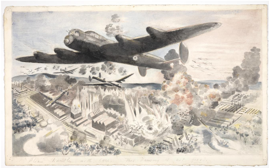
Paul Nash Augsburg Raid