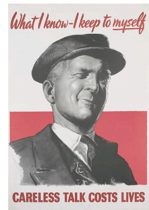
Imperial War Museum collection