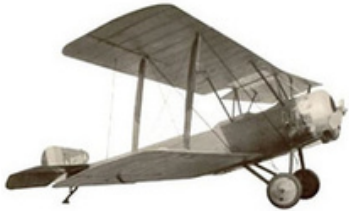
Sopwith 1 1/2 Strutter